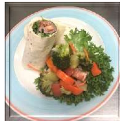
The beautiful final product!