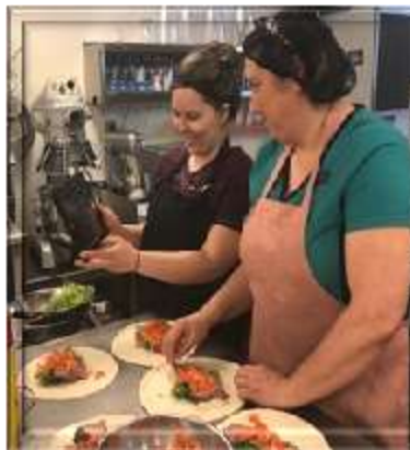
Creating the delicious meal.