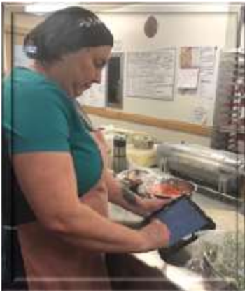
Starting with the recipe.

We now have a system that works for us, that reduces the amount of paper that we would normally use in the creation of a new menu and one that will grow with us as we continue to develop and improve the delicious meals the Valley Manor Dietary department creates for our residents.